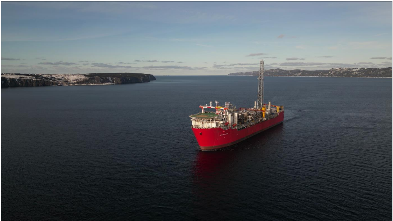
Terra Nova FPSO

Protecting Information Technology (IT) systems and data housed within those systems is a vital priority of the C-NLOPB. Focus continues to be placed on user awareness training to educate employees about cyber threats and cyber security protection practices. During 2022-23, IT established a three year digital technology strategy and end user device standard. IT continues to support C-NLOPB operations with planning, installation and implementation of various digitalization projects.