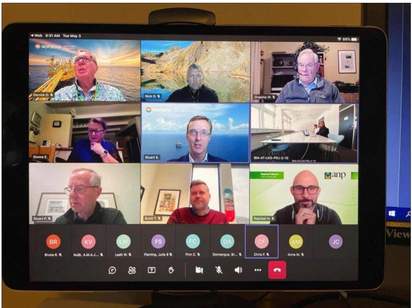
International Regulators' Forum members from 11 countries held a virtual mid-year meeting in 2022.

The C-NLOPB conducts systematic and comprehensive safety assessments of these applications, which includes the review of safety plans and other safety-related information submitted in support of the proposed activity. Audits and inspections are conducted prior to and after issuing an authorization in most cases.