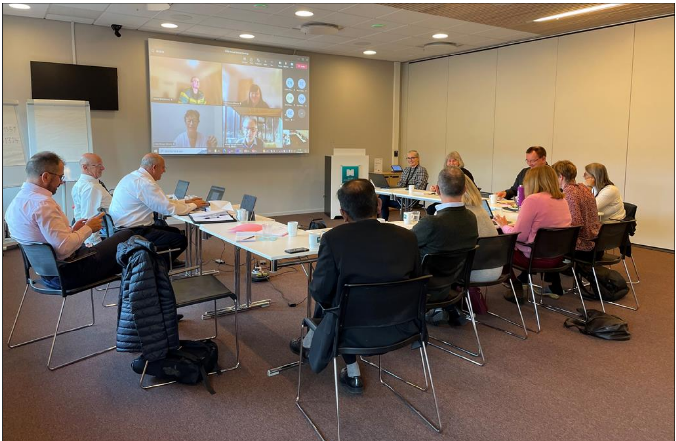
C-NLOPB's Director of Environmental Protection attended the International Offshore Petroleum Environmental Regulators Annual General Meeting in Norway in 2022.

Environmental Protection staff completed a number of offshore and onshore audits and verifications throughout the year. These included document review, questionnaires, interviews and onsite verification of compliance.