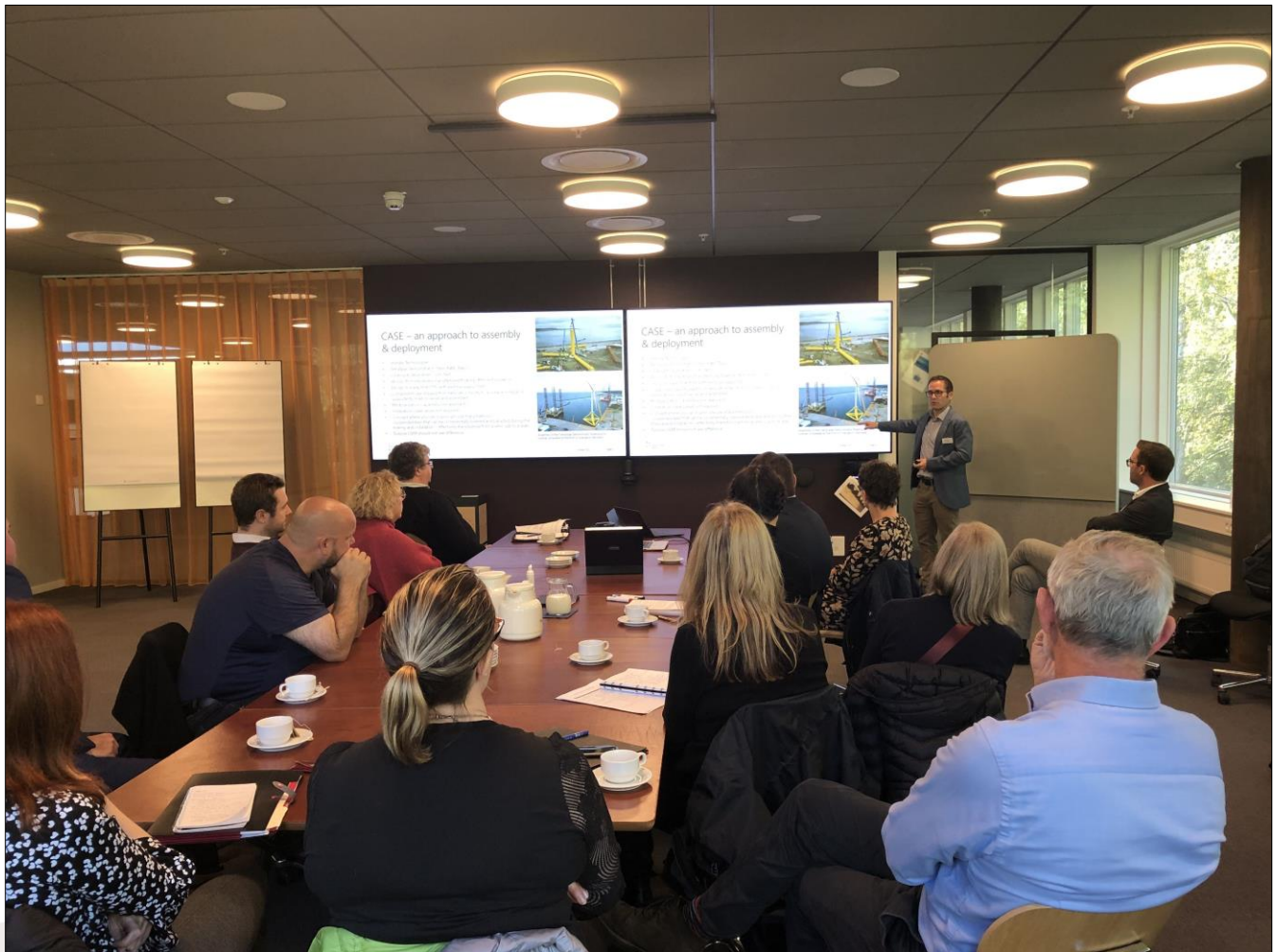
C-NLOPB staff attended the International Upstream Forum in Norway and the Global Offshore Wind Regulatory Forum in Denmark, in 2022.