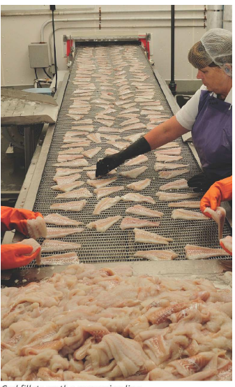
Cod fillets on the processing line

The Board makes recommendations to the Minister (the Minister) of the Department of Fisheries, Forestry and Agriculture (FFA) and the Minister makes the final decision on all licensing matters. The Board's recommendations to the Minister on all fish processing licence proposals or requests are made public, as are the final decisions of the Minister. To ensure equity and impartiality, all Board members are appointed by the Lieutenant-Governor in Council.