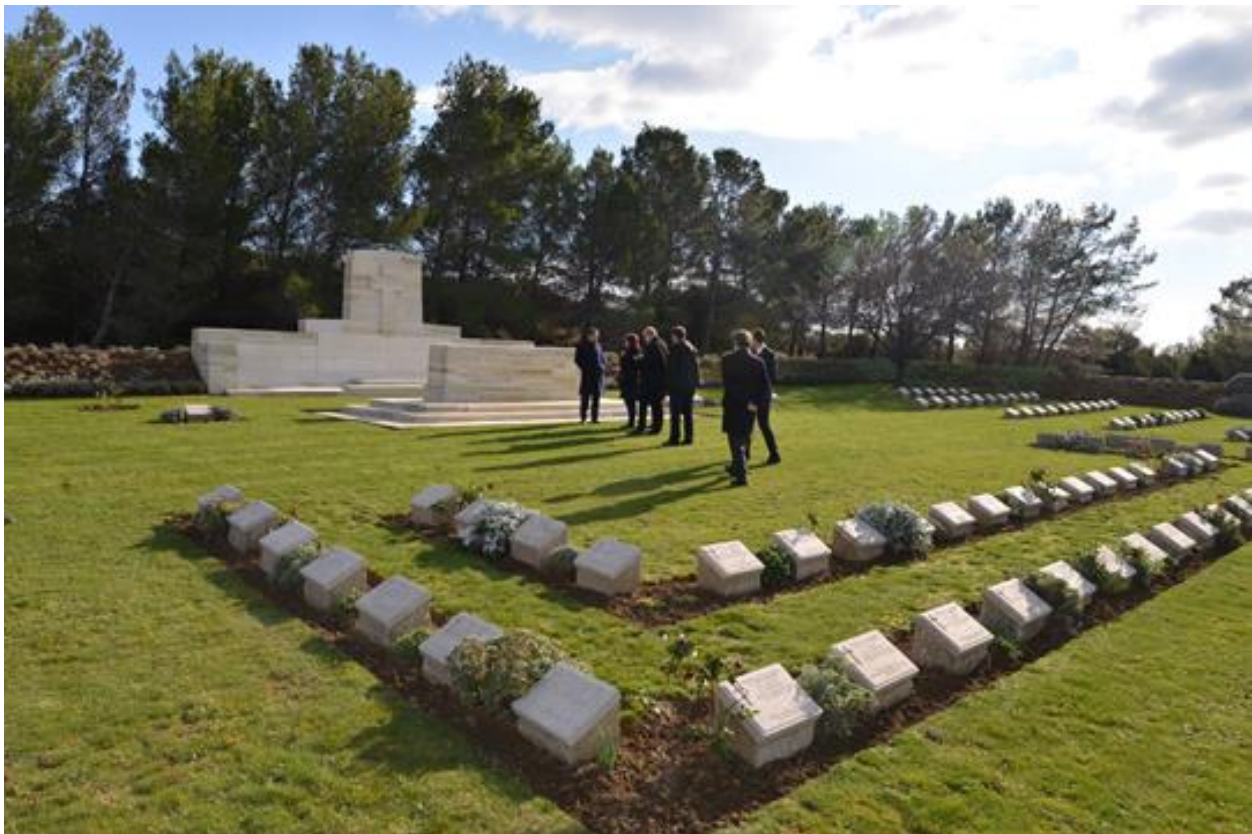
Hill 10 Cemetery facing south