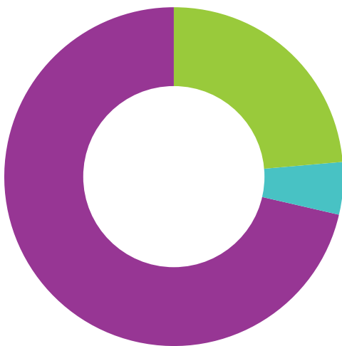
Mount Pearl North (2017 By-Election)

complete, as the current process requires.