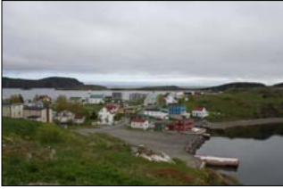
Trinity: Courtesy of Baxter Kean