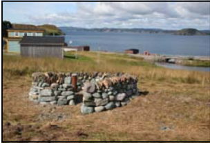
English Harbour: Courtesy of Baxter Kean