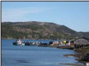
Princeton: Courtesy of Baxter Kean