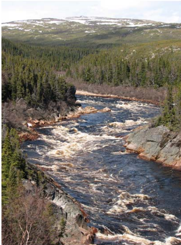
Pinware River, Labrador