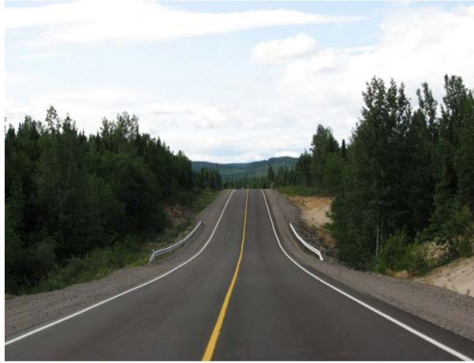
Trans Labrador Highway, Phase I