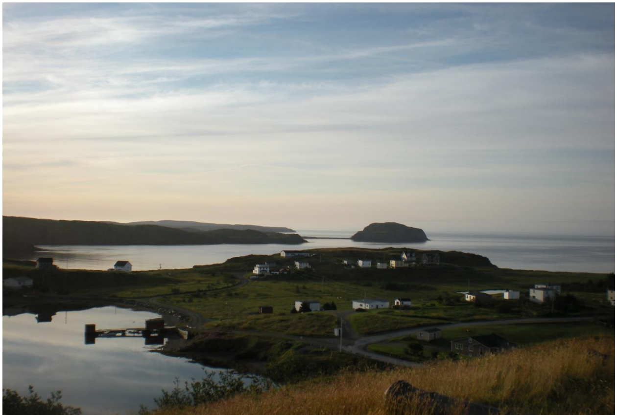
Ship Cove with Fox Island in the distance, Trinity Bight