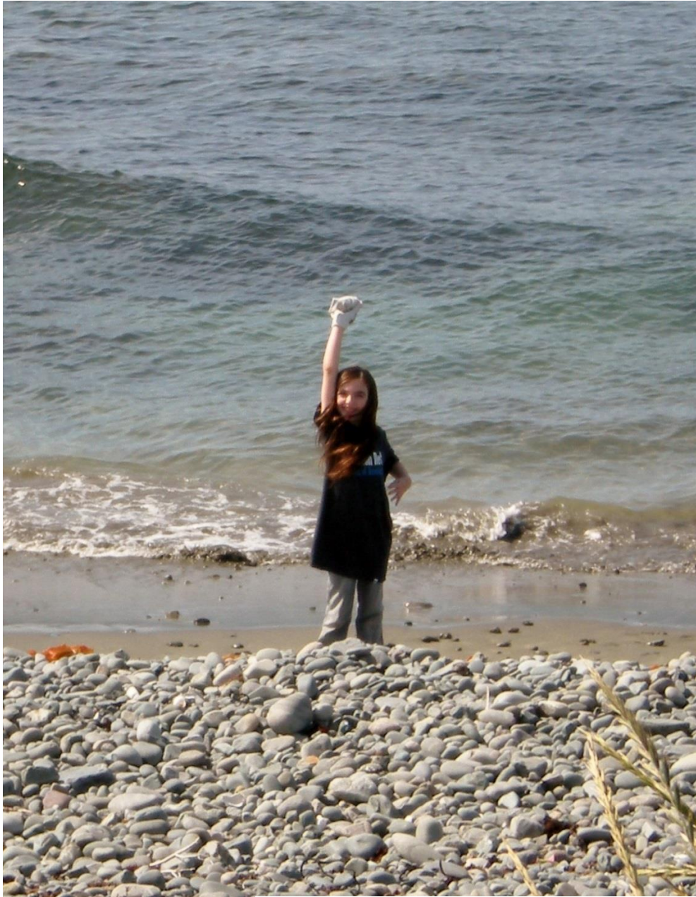
Enthusiastic participant of Bonavista Clean Up!