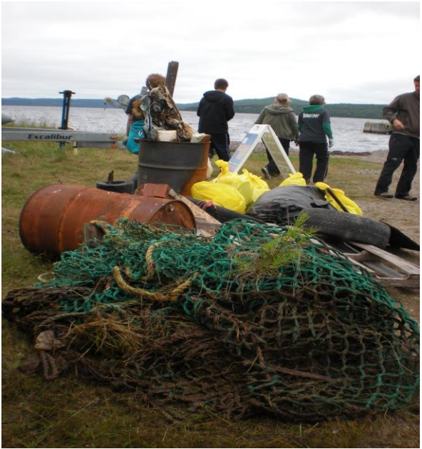
Photos from DRSB Community Clean-up Events