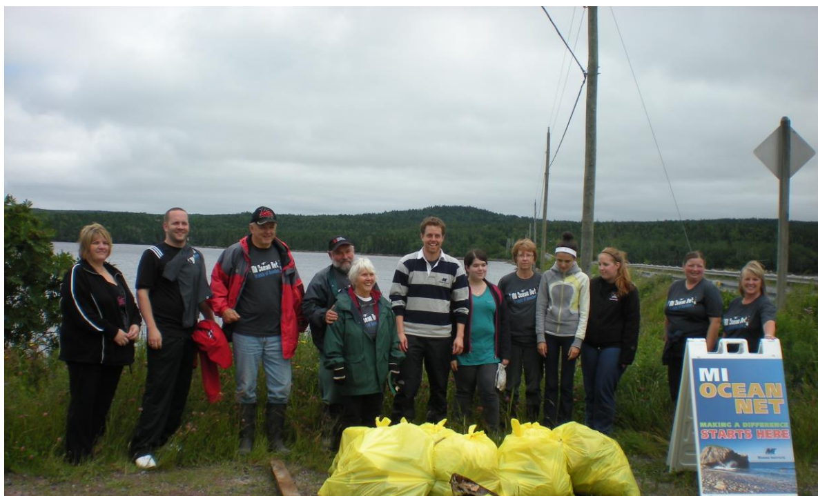
Port Blandford Community Clean up