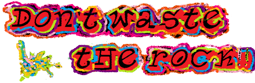
Logo for Don't Waste The Rock Environmental Youth Summit