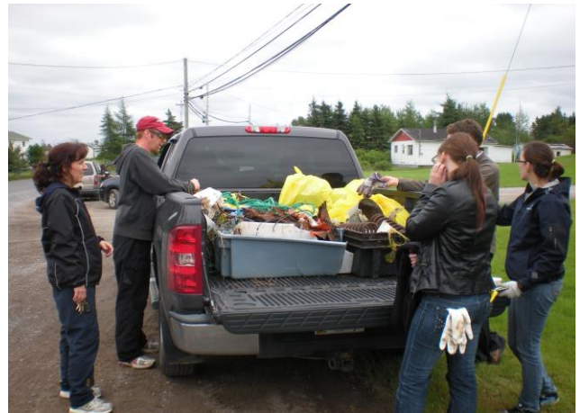
Top Photo: TBN Christmas Parade Float