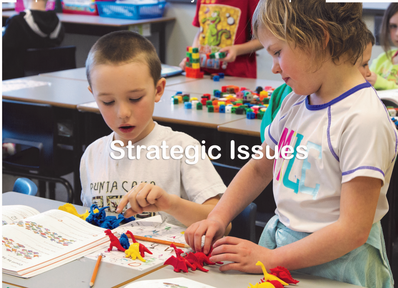
2014-2017 Strategic Plan

In consideration of the Provincial Government's strategic directions and the mandate and financial resources of the department, the following four areas have been identified as the department's key priorities for the next three years: Regulated Child Care; Early Childhood Learning; Primary, Elementary and Secondary Education; and K-12 School Infrastructure. The goal identified for each issue reflects the results expected in the three year timeframe while the objectives provide an annual focus. Measures and indicators are provided for both the goal and the first year's objective to assist the department and the public in monitoring and evaluating success.