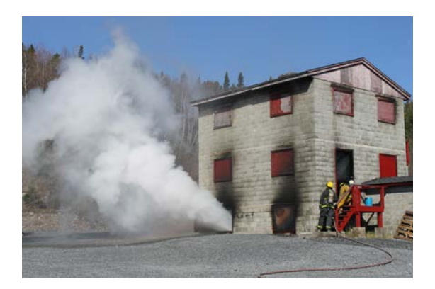
Fire Training at FES 2014 Training School