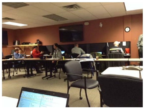
Emergency Operations Centre at work.

The Eastern region of Newfoundland and Labrador held their first Regional Emergency Management Planning Committee meetings on December 4, 2013 and January 15, 2014 respectively. These Committees are spin-offs from the PEMP committee. Membership is comprised of representatives of government departments/agencies located in these regions of the province and include other emergency management partners, such as RNC, RCMP, Regional Health Authorities, and utility companies. These Committees agreed to meet on a regular basis to address emergency management issues in their respective regions. The Western region continues with their meetings and associated work building on last year's progress while the Central region has plans to convene their own Regional Emergency Management Planning Committee in the coming year.