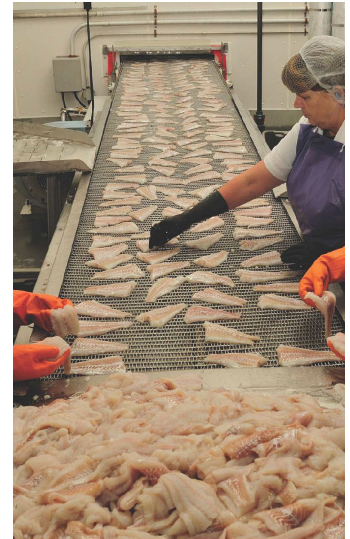
Cod fillets on the processing line.

The Board makes recommendations to the Minister (the Minister) of the Department of Fisheries, Forestry and Agriculture (FFA) and the Minister makes the final decision on all licensing matters. The Board's recommendations to the Minister on all fish processing licence proposals or requests are made public, as are the final decisions of the Minister. To ensure equity and impartiality, all Board members are appointed by the Lieutenant-Governor in Council.