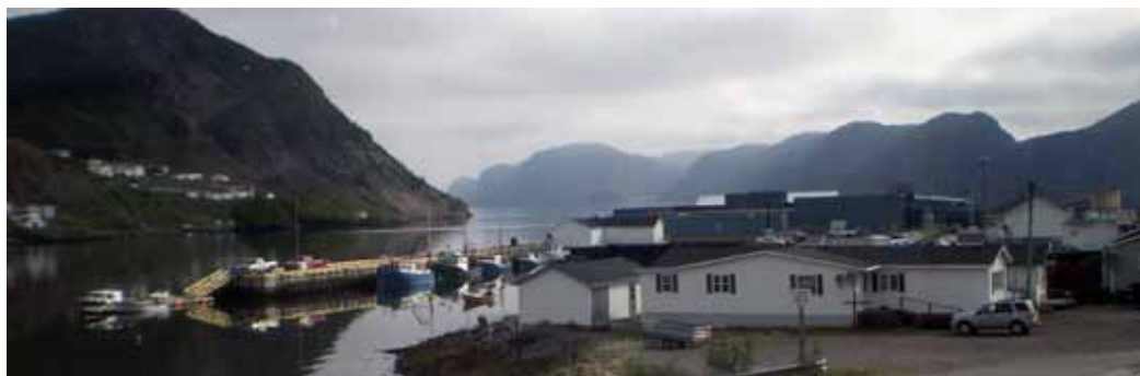
Harbour Breton Processing Plant

Meetings may be held at different locations throughout the year. This may be to review applications or to respond to the request of any person asking for information related to an application.