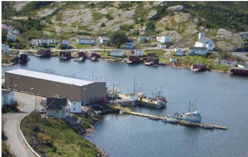
P. Janes Fish Plant, Salvage

The Board is required to meet a minimum of six times, on an annual basis. Meetings can be held through teleconferencing and/or regional meetings. In 2009, the Board met six times; details on business items considered by the Board are contained in Appendix B.