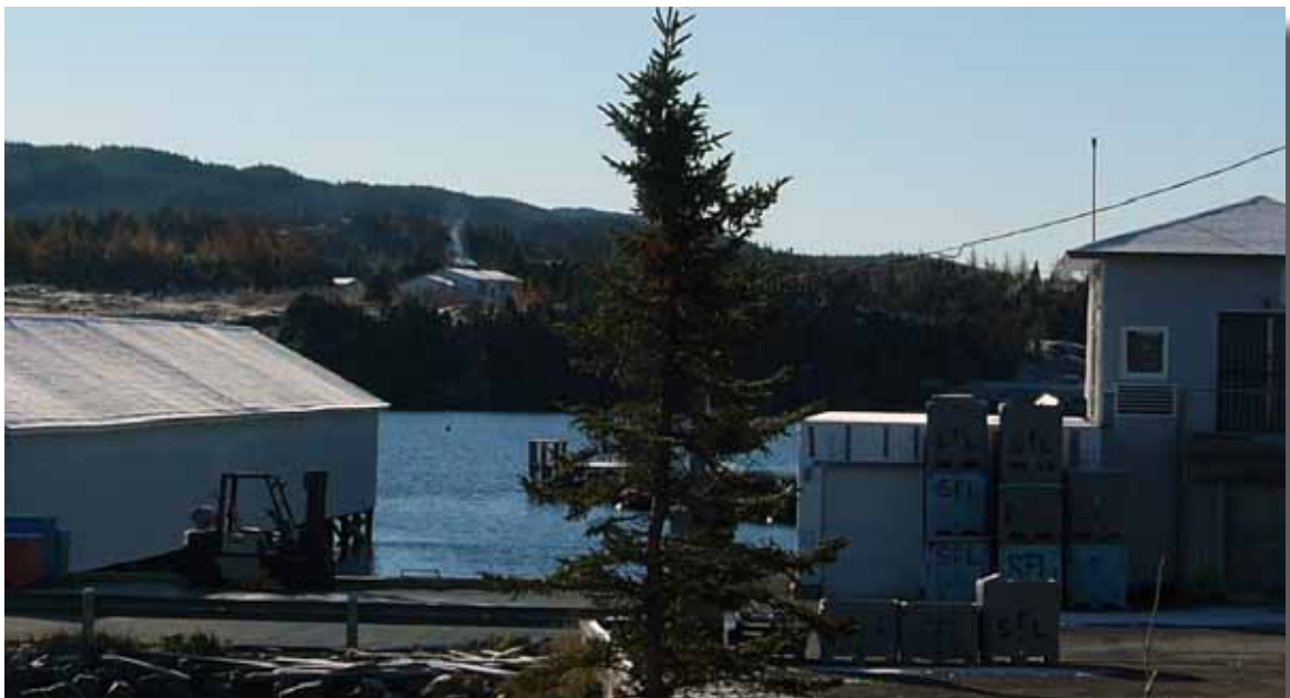
Summerville Plant, Bonavista Bay

MEASURE: Recommendations made to the Minister of Fisheries and Aquaculture on matters pertaining to fish processing licenses.