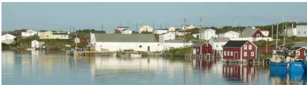
Change Islands Plant, Change Islands