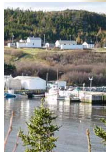
Furlong Brothers, Plate Cove West