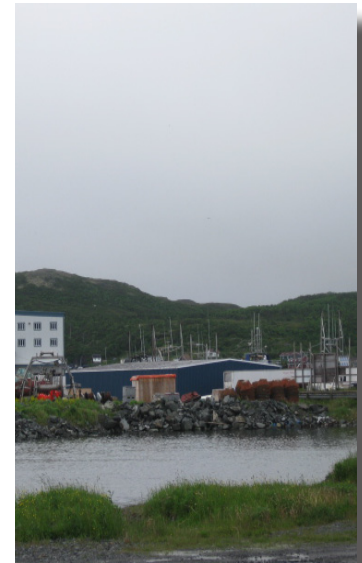
Plant in St. Anthony

The Fish Processing Licensing Board practices the relevant core values and guiding principles followed by the Department of Fisheries and Aquaculture, as set out in the Department's Strategic Plan 2008-2011 (refer to Appendix B).