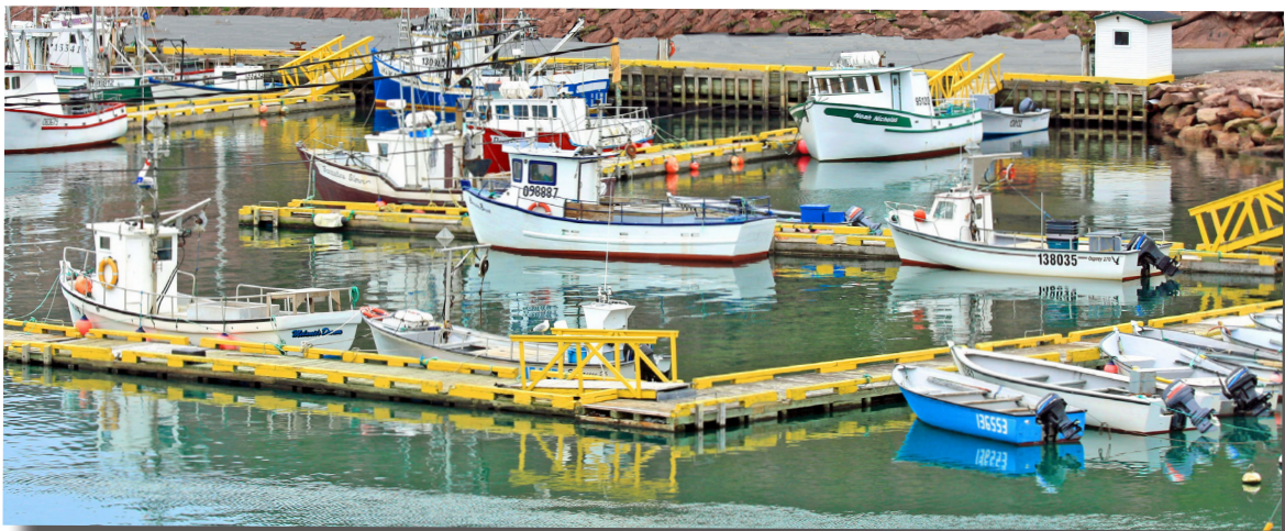
Wharf on the Baccalieu Trail

Members of the Board are selected with a consideration of gender balance and regional distribution. Members are expected to have a general knowledge of, but not a vested interest in, the fishing industry. Members of the 2010 Board represented the Eastern, Western, Central and Labrador regions of the province. The Secretariat to the Board is located at the Department of Fisheries and Aquaculture's headquarters in St. John's.