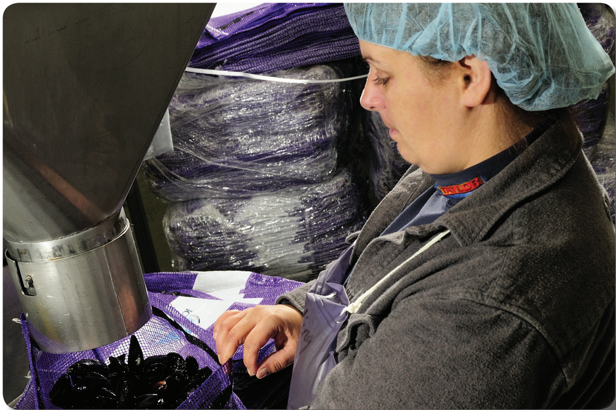
Preparing live mussels for the market.

http://www.fishaq.gov.nl.ca/licensing/Licensing_Policy_Manual_2010.pdf