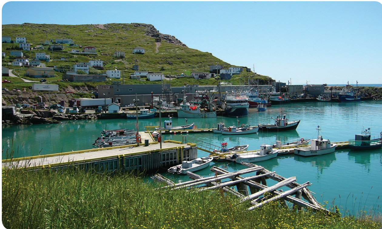
View of Bay de Verde, Quinlan Brothers fish plant.

The Fish Processing Licensing Board is funded annually by the Department of Fisheries and Aquaculture. This funding is used to cover travel costs, remuneration of Board members (according to Treasury Board guidelines), as well as any other miscellaneous costs associated with meetings. Where possible, the Board operates on a cost recovery basis through the collection of application fees.