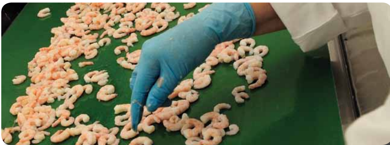
St. Anthony Seafood's Limited

In 2012, costs of the Board were approximately $20,000, which included remuneration ($12,500) and travel expenses ($7,500). Administrative costs incurred by the Board Secretariat, however, were not included in the Board's costs and were paid by the Department of Fisheries and Aquaculture. Revenues associated with applications considered by the Board in 2012 were $21,000.