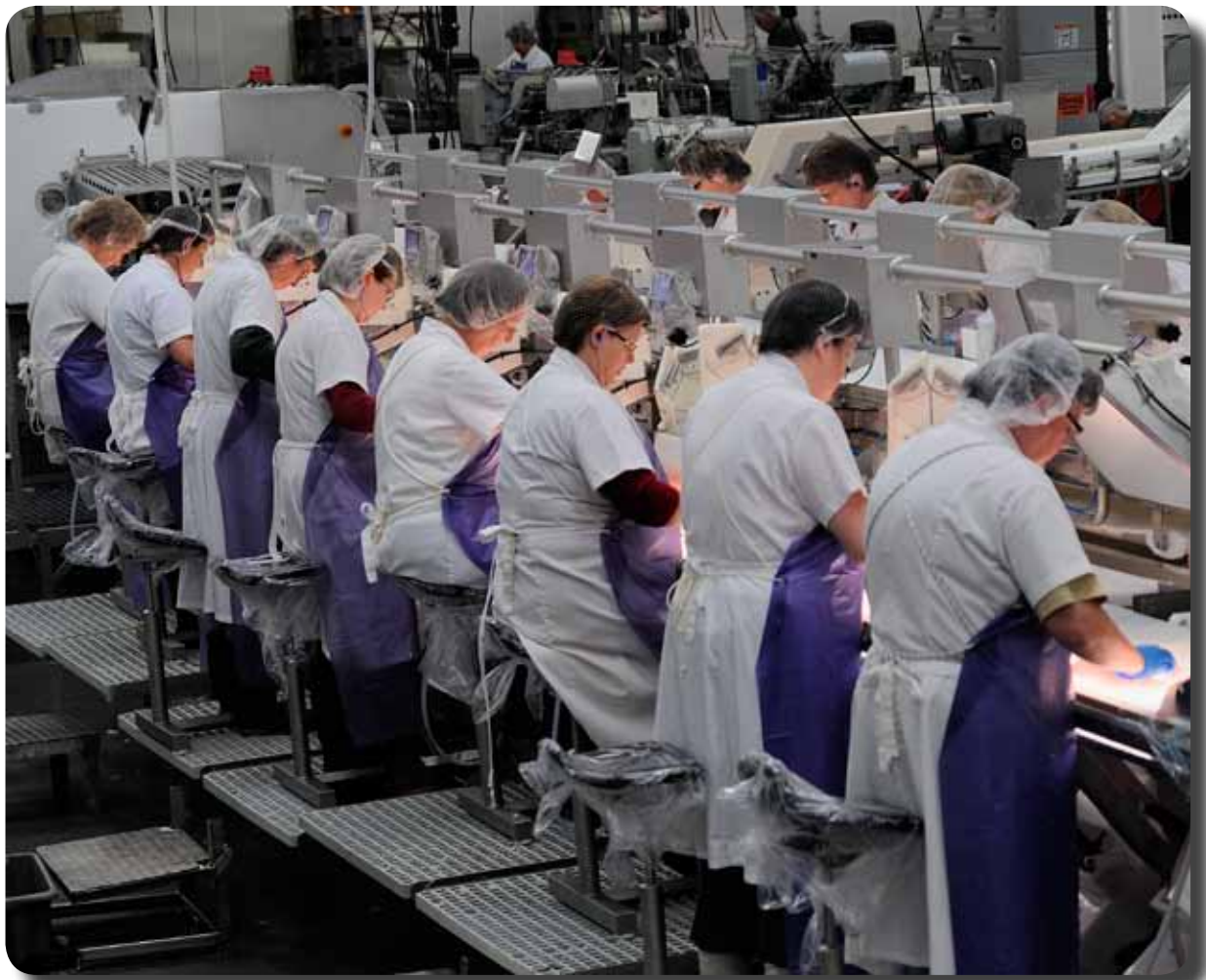
Icewater Seafoods Inc.

See also the following link to the Fish Processing Licensing Policy Manual: http://www.fishaq.gov.nl.ca/licensing/Licensing_Policy_Manual_2010.pdf