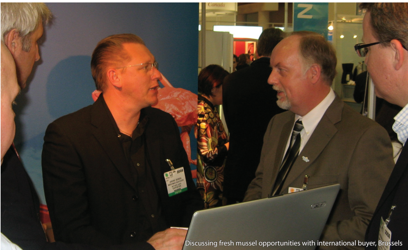
Discussing fresh mussel opportunities with international buyer, Brussels