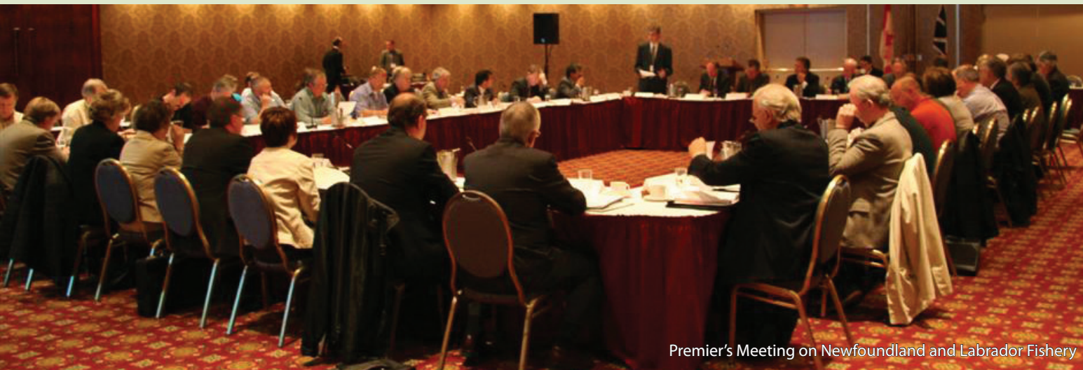
Premier's Meeting on Newfoundland and Labrador Fishery