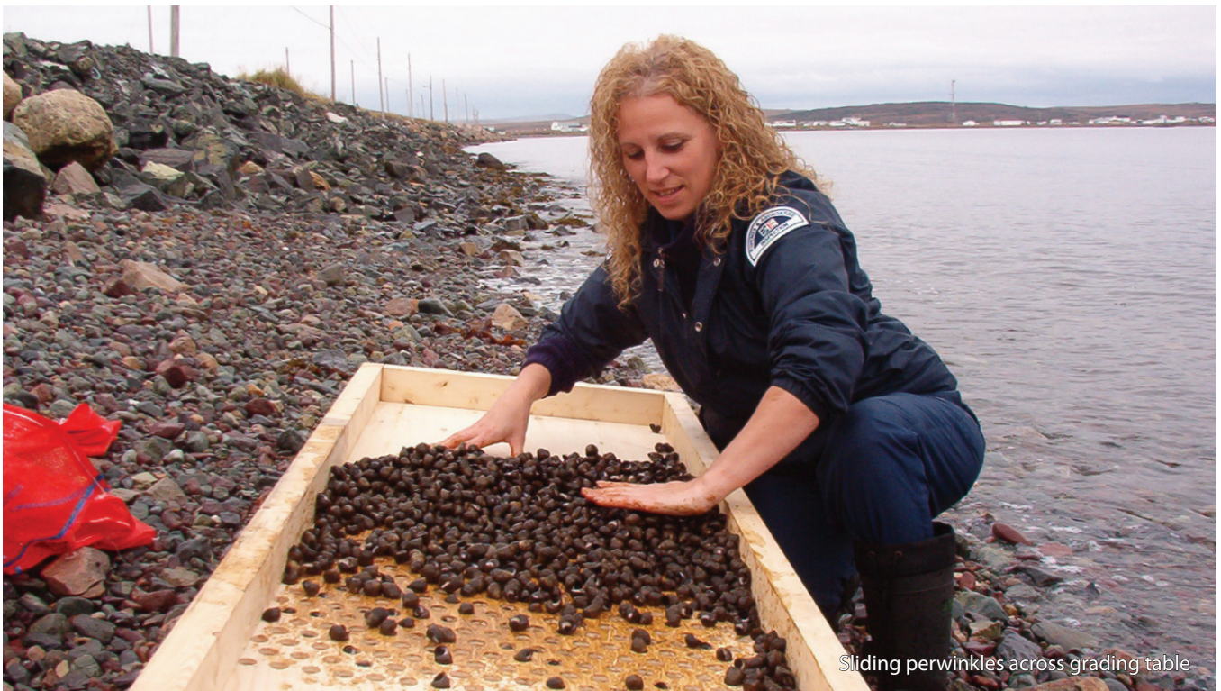
Sliding periwinkles across grading table

In response to challenges such as these, the province is working with industry on new innovative and competitive initiatives aimed at enhancing the value and presence of our seafood products locally, nationally and internationally. In this respect, the seafood industry, as do other Newfoundland and Labrador industries, faces additional challenges in terms of attracting and retaining a skilled and talented work force. An aging labour force steadily moving into retirement, combined with continuing out-migration in rural regions which sees both skilled and unskilled labour leaving the province for higher wages, poses a new set of challenges as government and industry strive to develop and implement innovative and competitive initiatives. It is within such a context that we endeavor to enhance the value of our fishing and aquaculture industries.