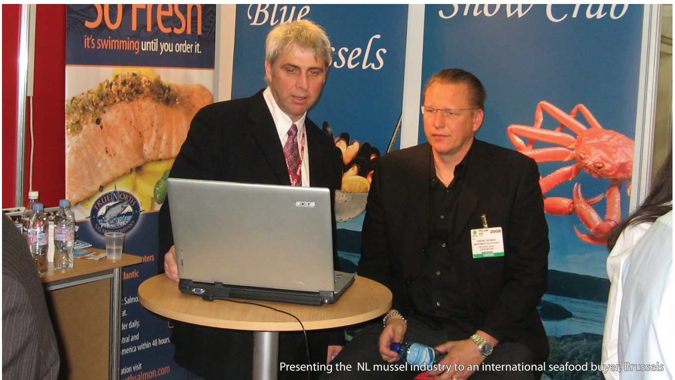
Presenting the NL mussel industry to an international seafood buyer, Brussels

To strengthen the fisheries and aquaculture industry in Newfoundland and Labrador, the province will work to increase its role and to amplify its voice in ocean management. The province is also committed to promoting its strategic aquaculture priorities to the federal government to secure federal funding for aquaculture initiatives.