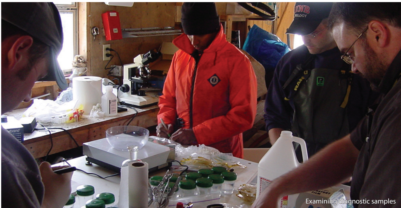
Examining diagnostic samples

Each individual demonstrates respect for the public they serve through the following actions: timely and courteous responses to public inquiries; efficient and cost-effective delivery of programs and services; and identification of cost-saving measures wherever possible.