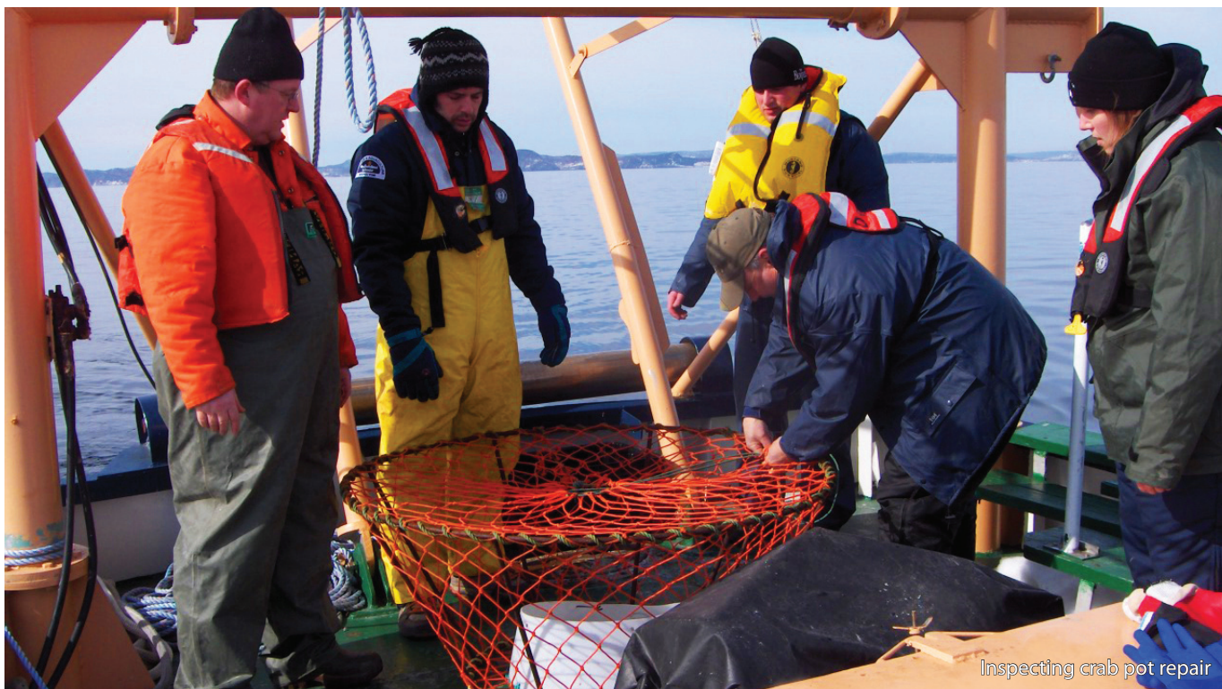
Inspecting crab pot repair