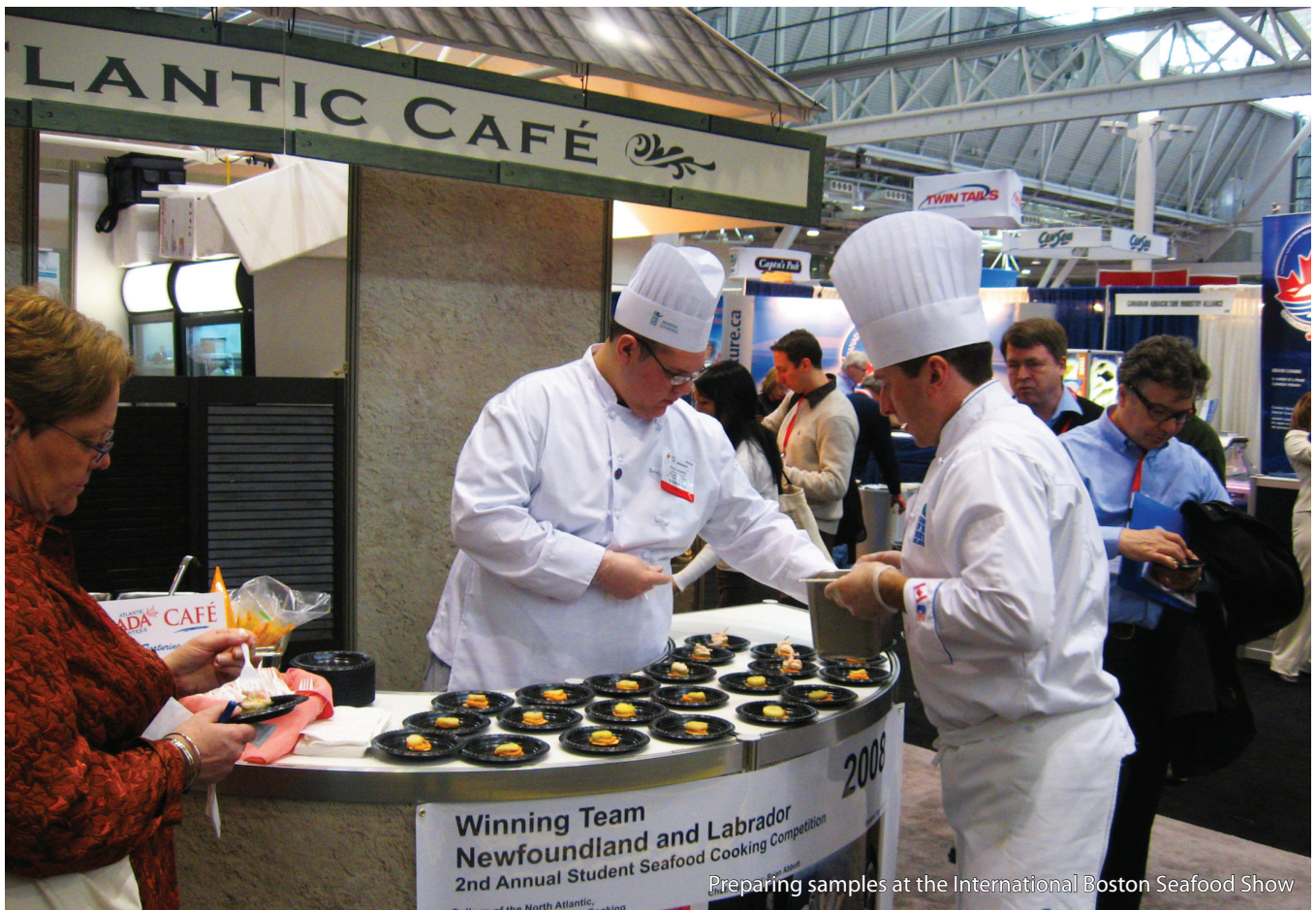
Preparing samples at the International Boston Seafood Show

The Fishing Industry Renewal Strategy resulted from efforts on the part of the Provincial and Federal Governments and industry stakeholders to ensure the sustainability, viability and competitiveness of our fishing industry. The Province's 2008-09 Budget designated 15 million dollars over a three year period for the implementation of the provincial initiatives of the FIR Strategy. With the ever-changing economic environment, evolving science and technology, expanding marketplace, growing need for a specialized workforce, facilities and infrastructure, there is constant transformation in the fishing industry. The Provincial Government will be proactive and adaptable in establishing policies and mechanisms that will support industry renewal. It is important to translate sound scientific data and business acumen into clear policy that will advance the growth of fisheries in Newfoundland and Labrador. Industry and other government partners serve as important collaborators through their participation and contribution to the development of an emerging and highly regarded industry.