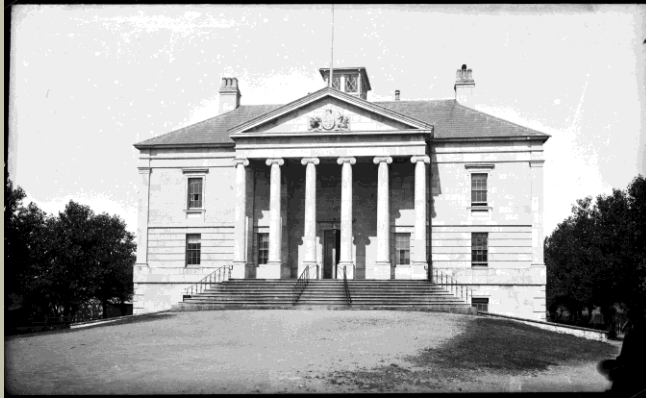
Colonial Building 1850-1959

House of Assembly Newfoundland & Labrador