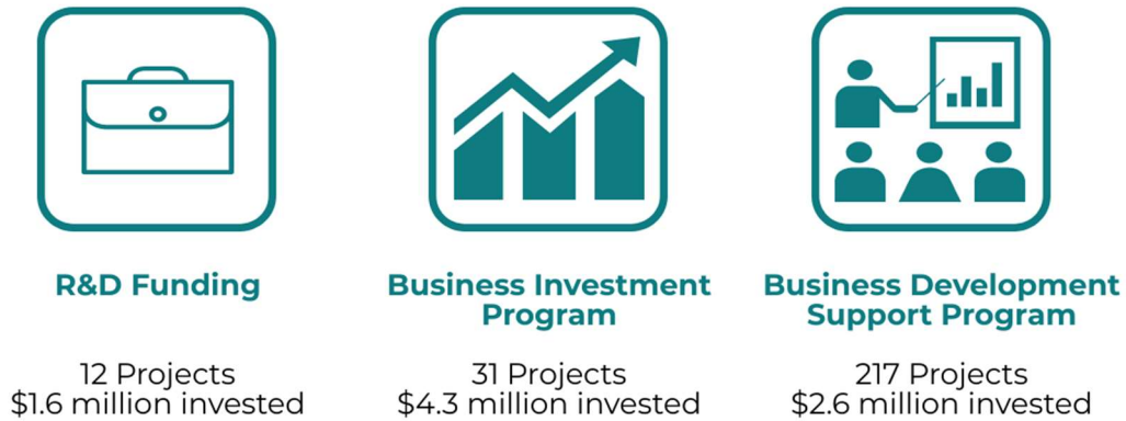
Figure 1: Investment in Commercial Projects (2019-20)