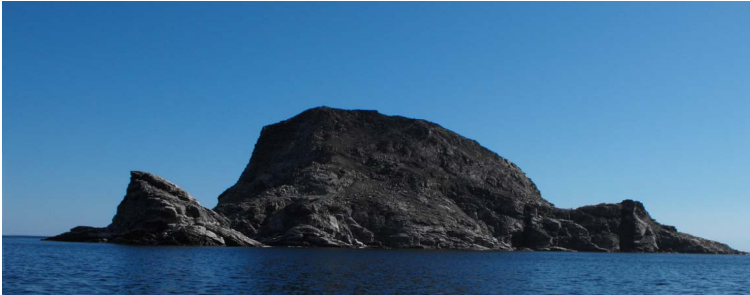
Island outside Saglek Bay

On 10 August 2009 approximately 20 relocatees and other Inuit were joined by members and officials of the Nunatsiavut Government, Premier Williams, Minister Pottle and provincial officials in an official unveiling of the new monument.