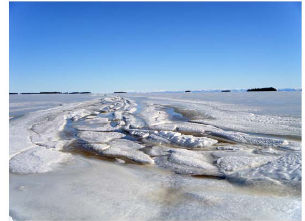
Ice flows near Northwest River, Labrador

In 2009 the Government of Newfoundland and Labrador introduced legislation in the House of Assembly that will assist in the resolution of land claims in northern Labrador and offshore areas adjacent to northern Labrador and northern Quebec. These amendments provide increased clarity and certainty for the future economic development of the region. The legislation was passed by the House of Assembly and received Royal Assent in December 2009. Once overlapping agreements are resolved by Aboriginal groups, they are able to come into effect when incorporated into the land claims agreements of each Aboriginal group. The Overlap Agreement between Labrador Inuit and Nunavik Inuit was incorporated into the Nunavik Inuit Land Claims Agreement in 2008.