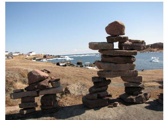
Red Bay, Labrador

The Department continues to work with staff and board members of the regional economic development boards in Labrador. Senior Analysts within Labrador Affairs work with respective Labrador Boards to promote communication on regional economic development issues. The Labrador Boards include Hyron Regional Economic Development Corporation, Central Labrador Economic Development Board, Southeastern Aurora Development Corporation and Labrador Straits Development Corporation.