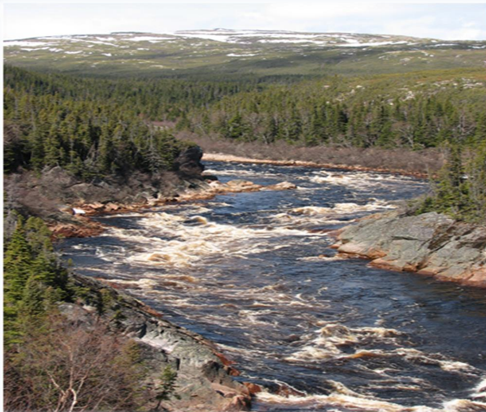
Pinware River, Labrador

By March 31, 2017, LAAO will have further developed guidelines and processes to assist departments and agencies in the discharge of any duty to consult Aboriginal governments / organizations that may arise.