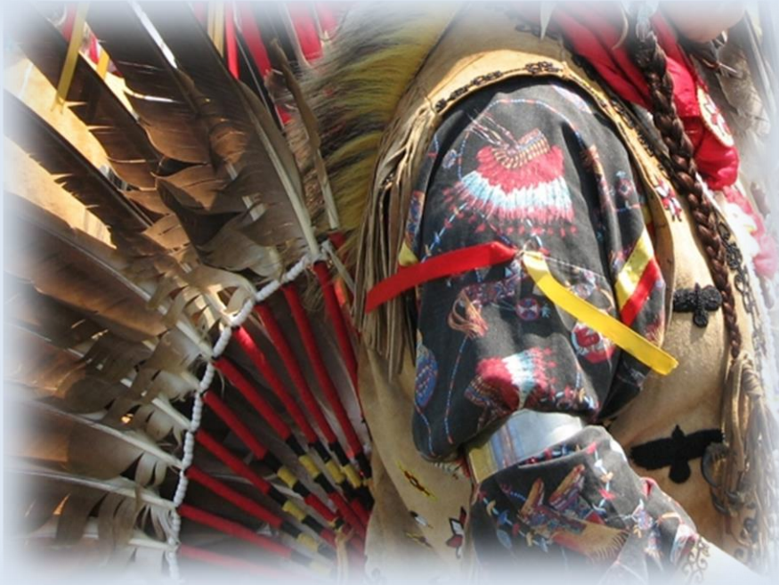
Traditional Mi'kmaq Regalia, Conne River Pow Wow