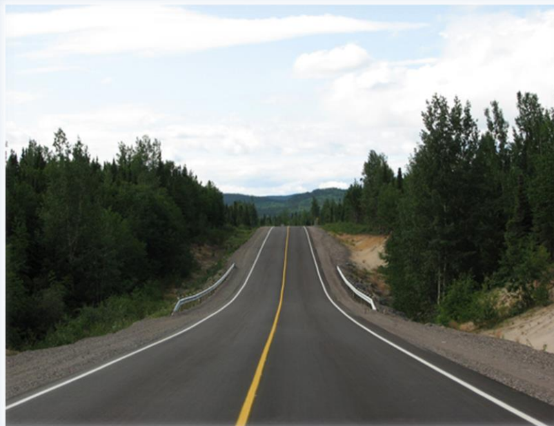
Trans Labrador Highway, Phase I

The Labrador and Aboriginal Affairs Office vision is of a strong and vibrant Labrador, Aboriginal people who are empowered to pursue their aspirations, and a diverse, inclusive, prosperous province, where all people have the opportunity to achieve their hopes, and contribute to their communities, regions, and the province.