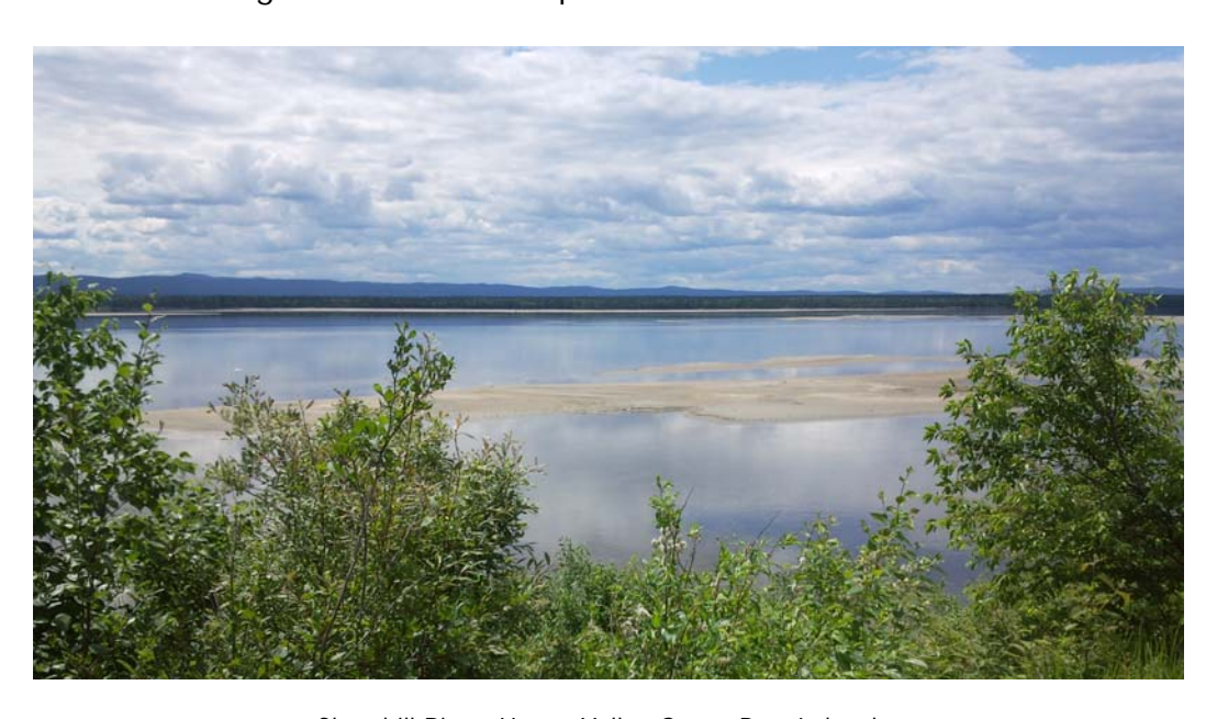
Churchill River, Happy Valley-Goose Bay, Labrador

Provincial engagement with resource development stakeholders in Labrador is crucial to unlocking the resource rich potential of Labrador.