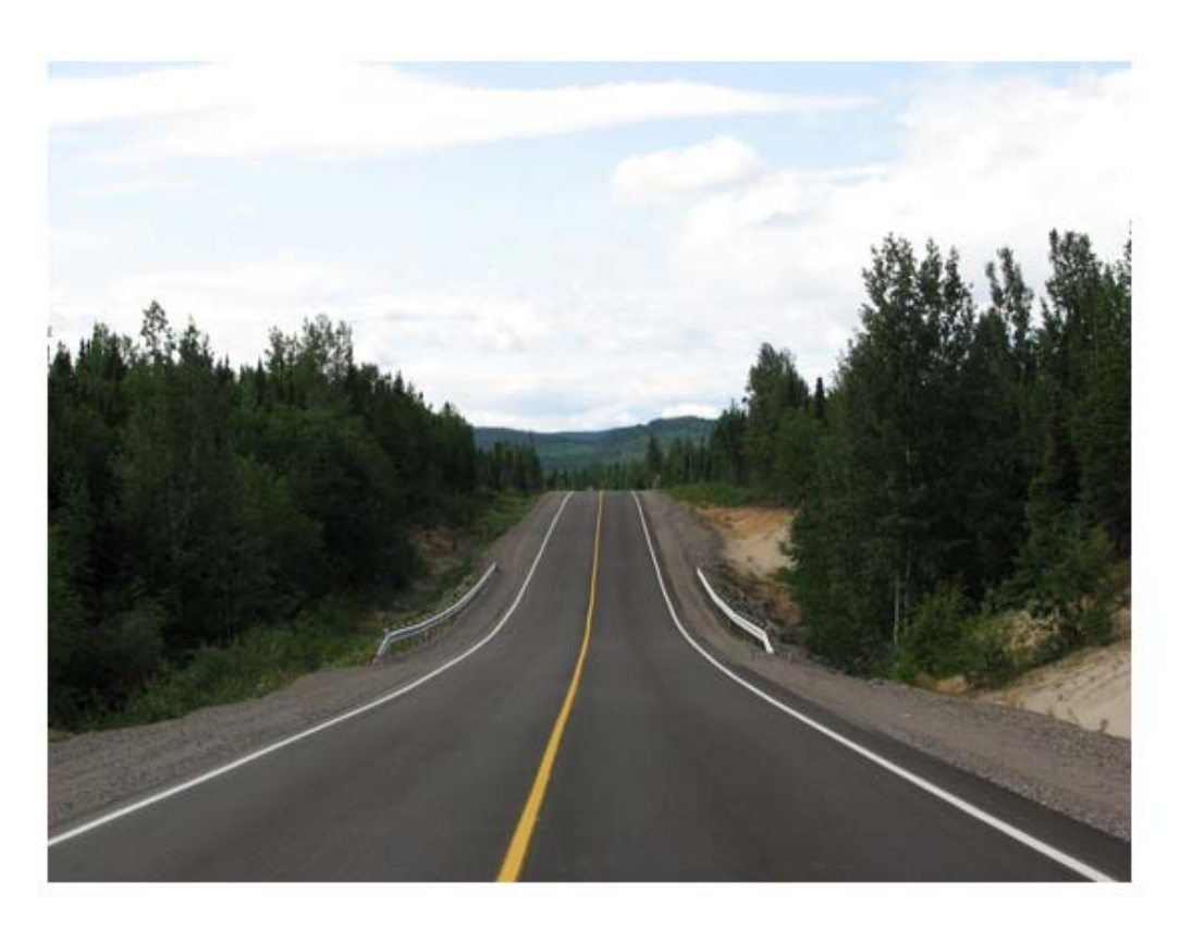
Trans Labrador Highway, Phase I