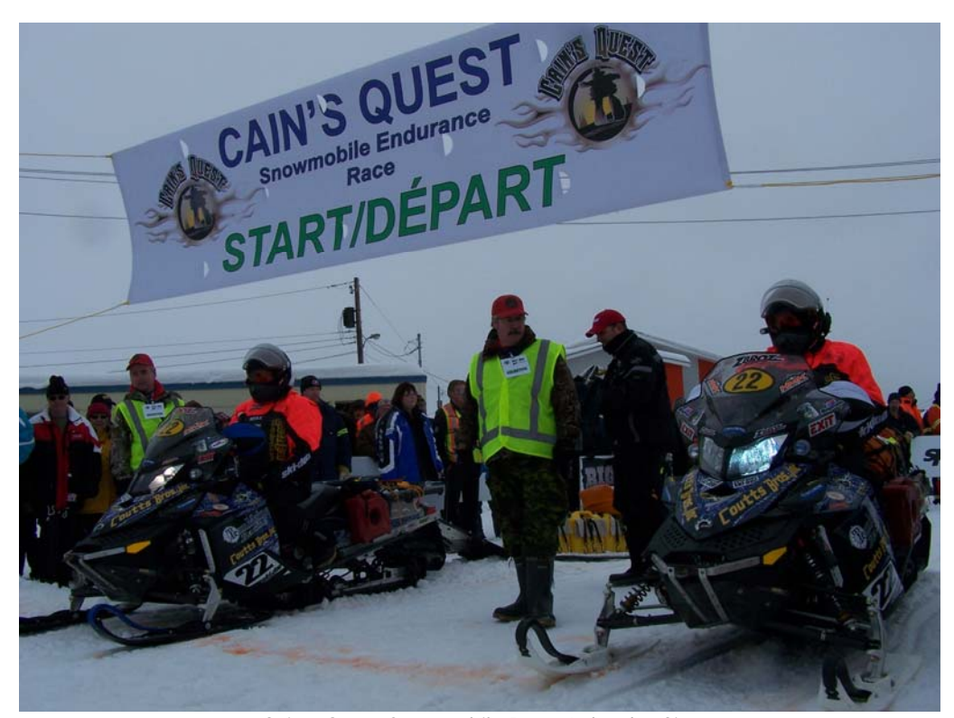
Cain's Quest Snowmobile Race, Labrador City