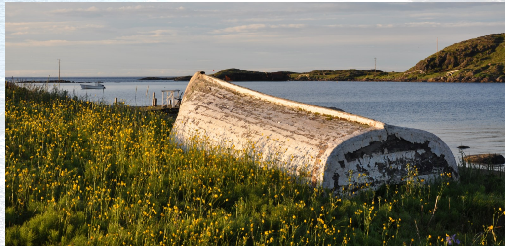
Red Bay, Labrador