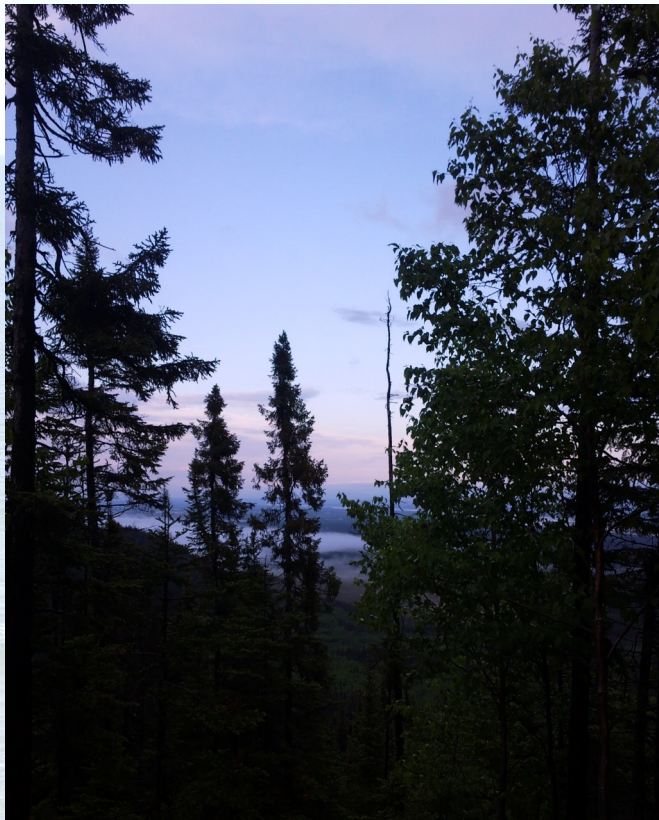
View from Pine Tree, Lake Melville

The Institute offers scientifically supported recommendations to the federal ministers of Environment and National Defence on policy issues relating to the impacts of low-level flying.