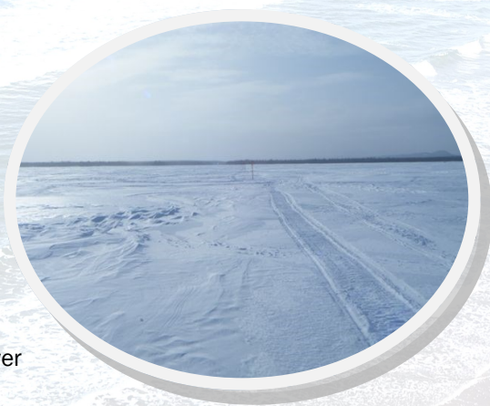
Trail Marking North West River to Mulligan

The Government of Newfoundland and Labrador continues to provide funding from the Labrador Transportation Grooming Subsidy (LTGS) to coastal communities that do not have year-round road connections to other areas of Labrador. This subsidy supports government's strategic direction to improve economic and social development in Labrador. The Provincial Government provides support to regions along the north and south coasts of Labrador for maintenance of the winter trail systems. The Inuit Community Governments of Hopedale, Postville, Makkovik, and Rigolet, as well as the Eagle River Development Association, Labrador White Bear Development Association (LWBDA), Mud Lake, Town of North West River and Grand River Snowmobile Club, received funding from this program. Weather conditions for the 2012-2013 grooming season were exceptional. Emergency shelters were placed in strategic locations on the trail between Happy Valley-Goose Bay and Rigolet and between North West River and Postville. The overall operating budget for the LTGS for the 2012-2013 grooming season increased to $351,000.