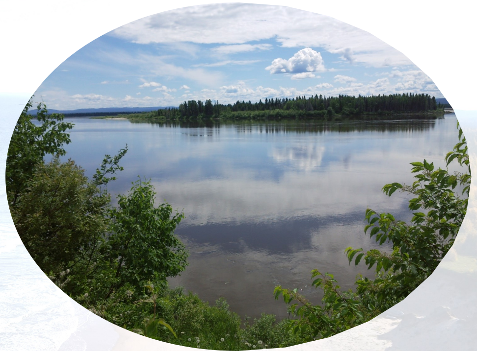
Churchill River, Labrador

This initiative supports government's strategic direction to enhance accessibility for residents of Labrador. LAO participation on the Board also ensures Provincial Government policy reflects Labrador interests.