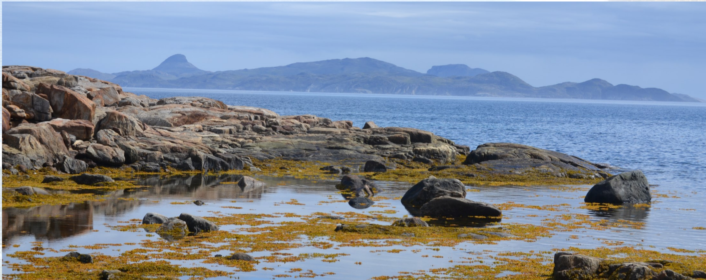
Coastline in the Torngat Mountains National Park

The Labrador Affairs Office will report upon the objective and indicators for the 2012-2013 fiscal year.