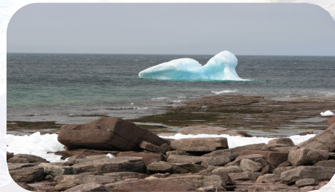
Iceberg off South Coast of Labrador

The Labrador Affairs Office is mandated to advance social and economic development in Labrador. This is achieved through coordination and collaboration on Labrador related initiatives. The office collaborates with Provincial Government departments/entities, federal, Aboriginal and municipal governments and industry organizations to support advancement of economic and social development in Labrador. Often the Labrador Affairs Office takes the lead role in coordinating intergovernmental committees such as the Environmental Management Planning and Consultative Committee and the Northern Development Ministers' Forum.