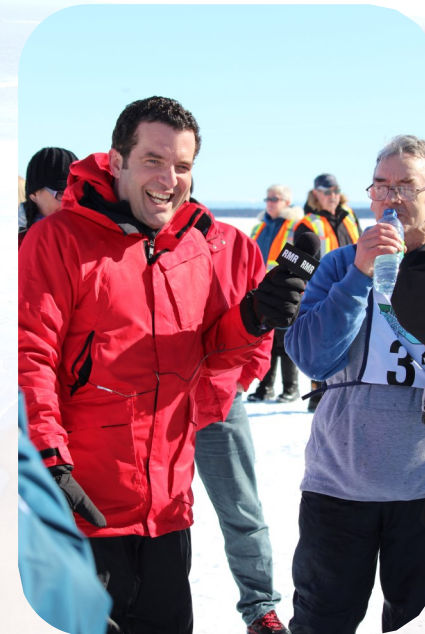
Rick Mercer at the 2013 Labrador Winter Games

The Labrador Winter Games provides an opportunity for Labradorians to come together to celebrate Labrador sports and culture. More than 400 participants from 25 communities throughout Labrador compete in contemporary sport and traditional skill competition such as dog sledding and snowshoeing. The 30 anniversary Labrador Winter Games took place from March 3 to 9, 2013 The Provincial Government provided $500,000 to support the 2010 Labrador Winter Games. A Labrador Winter Games Board of Directors is responsible for overseeing and managing operations of all aspects of the games. LAO is a member of the Board.