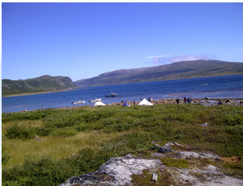
Tents outside Hebron, Labrador

Published research in the past year include: The Future of Mining in Canada's North (January 2013) and Getting it Right: Assessing and Building Resilience in Canada's North (May 2012). LAO provides input on research topics and also reviews and provides feedback on research terms of reference and draft reports. LAO attended the past year's roundtable meetings held in Iqaluit, Nunavut in May 2012.