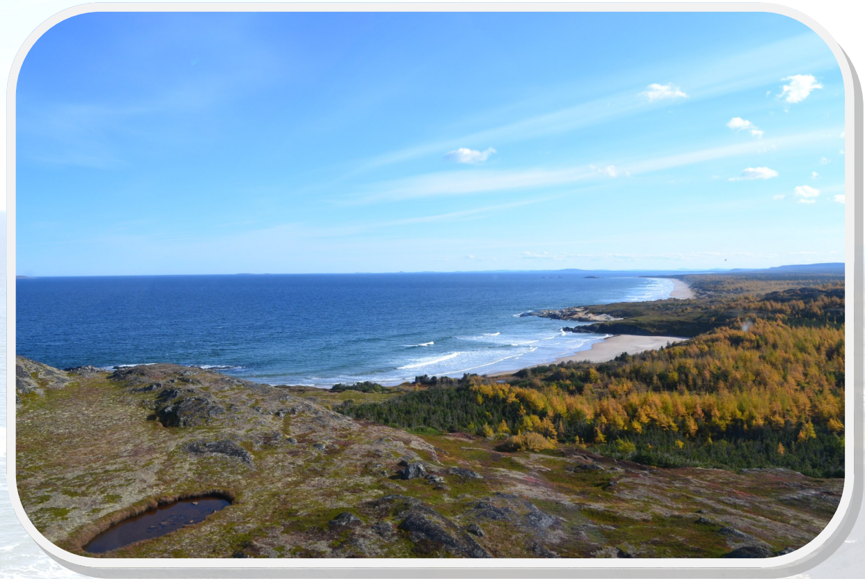
Northern tip of the Wunderstrands, Labrador

The proposed National Park Reserve in the Mealy Mountains will encompass 10,700 square kms.