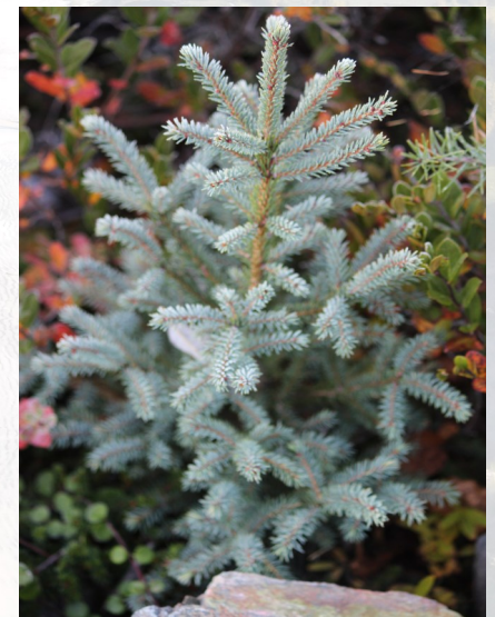
Blue Spruce near Port Hope Simpson

On January 28, 2013, due to continued decline of the George River caribou herd, the Provincial Government initiated an immediate ban on all caribou hunting in Labrador for conservation purposes for a period of five years, with a review after two years. Recent census results, as well as biological information gathered and ongoing population modeling, indicate the herd currently stands at less than 20,000 caribou, representing a decline of more than 70 per cent since the July 2010 estimate of 74,000. The Provincial Government will continue to monitor the George River caribou herd, assess the population on an annual basis, and continue to work closely with Aboriginal groups while it proceeds with protecting this herd. LAO supported the efforts of the Department of Environment and Conservation (ENVC) through government's consultative process and through participation at stakeholder meetings. ENVC established a Provincial George River Caribou Herd Advisory Committee which is responsible for promoting conservation of the herd and providing management recommendations to the Minister of Environment and Conservation. LAO's participation on this Committee supports the strategic direction of Government to improve social development in Labrador, enhance accessibility for residents of Labrador and to ensure Provincial Government policy reflects Labrador interests.