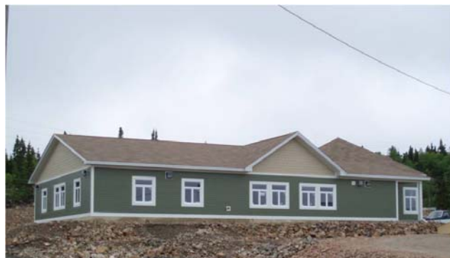
Central Regional Administration Office – Norris Arm North

Capital expenditures totaled $36.8 million for the 2010-11 fiscal year. $29.9 million of that total was for capital infrastructure and equipment for the Central Newfoundland waste management system. Construction is ongoing at the regional full-service site located near Norris Arm North. A milestone was achieved in the fall of 2010 with the completion of the new regional administrative office located adjacent to the regional landfill site. Fall 2011 is the target date for commencement of operations at the Norris Arm site. Construction activity is near completion at seven local transfer stations strategically located throughout the region which are also scheduled to begin operations in Fall 2011. When these facilities are completed, 42 existing dumpsites will be closed.