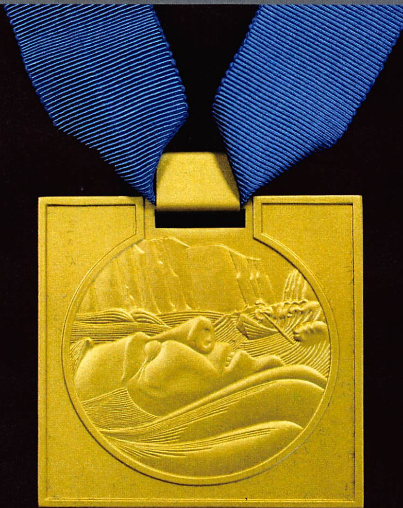
Newfoundland and Labrador Bravery Award