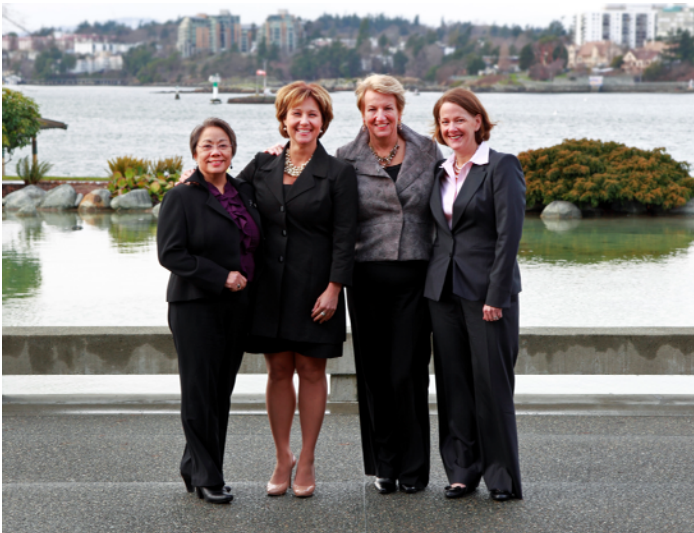
The Honourable Kathy Dunderdale, Premier of Newfoundland and Labrador, with Canada's other three female premiers, left to right: Premier Eva Aariak, Nunavut; Premier Christy Clark, British Columbia; Premier Dunderdale; Premier Alison Redford, Alberta. The premiers were attending the Council of the Federation Meetings in Victoria, B.C. January 16 and 17, 2012.