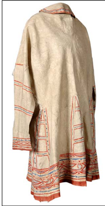
Rare Innu Caribou Coat