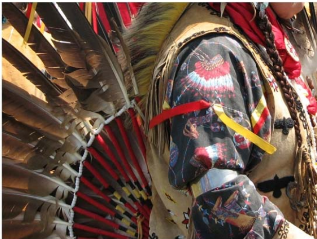
Traditional Mi'kmaq Regalia, Conne River Pow Wow