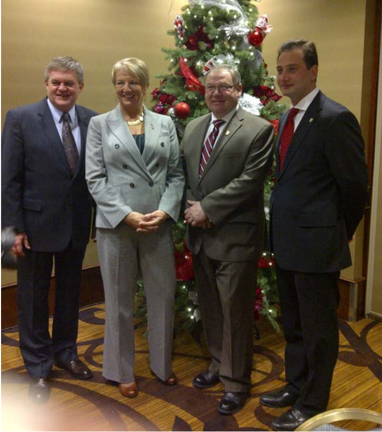
The Honourable Premier Kathy Dunderdale with her Atlantic Canada colleagues of the Council of Atlantic Premiers, in St. John's, December 5, 2011.