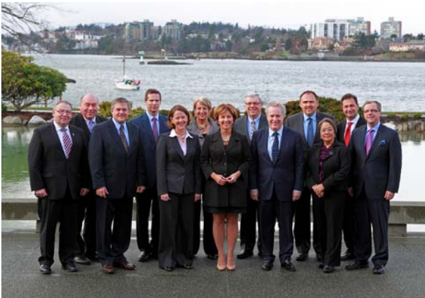
The Honourable Kathy Dunderdale, Premier of Newfoundland and Labrador, poses with provincial and territorial premiers at the Council of the Federation meetings, January 16, 2012, in Victoria B.C.