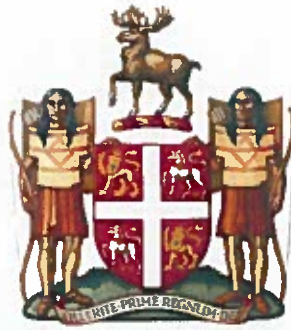
House of Assembly

Tabled by the Member for Compuhis Bay East - Bell Island.