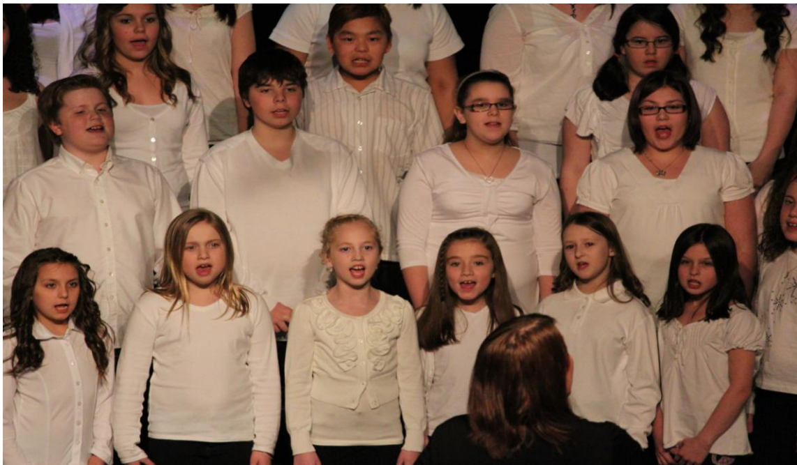
Festival 500 – Pan Labrador Choir

The Labrador School Board continued to support its safe and caring schools strategy through improving school infrastructure with its summer maintenance program.