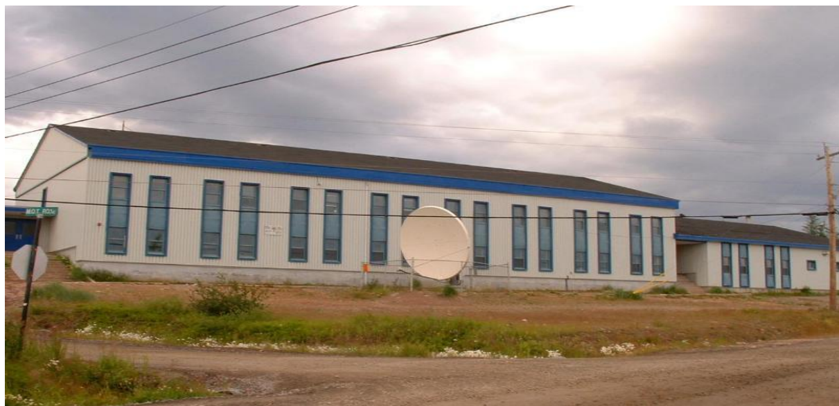
Henry Gordon Academy

The Labrador School Board, in conjunction with the Department of Education, continued to work on professional development sessions for administrators. Administrators plus senior administration attended several conferences, including the Canadian Association of Canadian Administrators Conference and the Canadian Association of School Boards Conference. Each session had topics ranging from technology, restorative justice to the role of school boards.