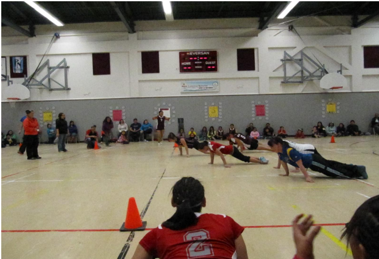
Winter Sports Meet