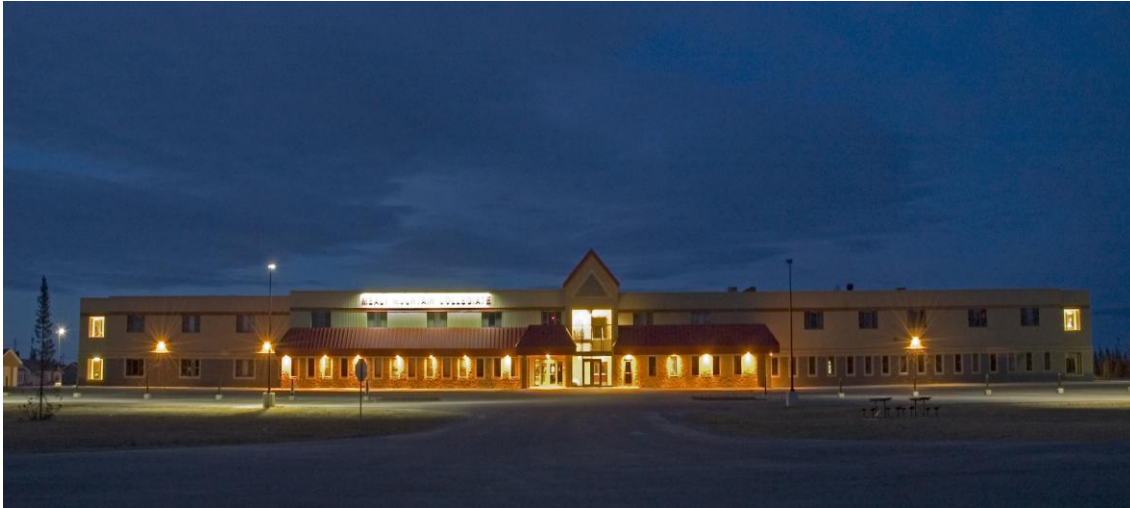
Mealy Mountain Collegiate