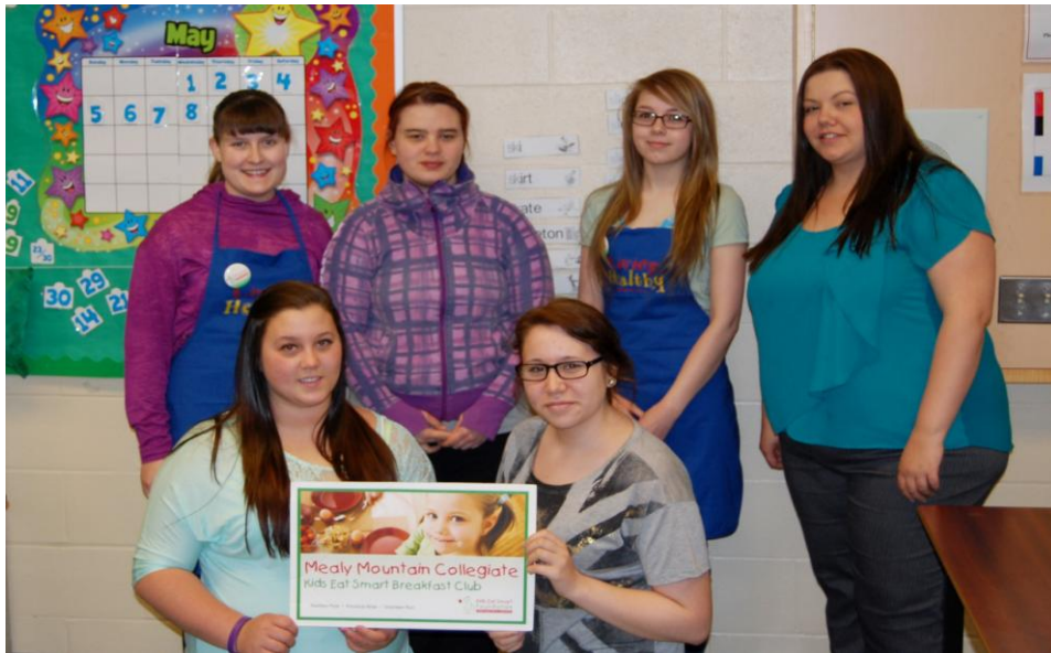
Volunteer appreciation from Kids Eat Smart

All Labrador schools have now implemented a Safe Access to Schools policy and a copy of the policy was posted and sent to parents. In general, it has been very well received by all stakeholders: staff, students, parents and visitors. The District is also now using PowerSchool to track behaviours resulting in discipline and to address office referrals.