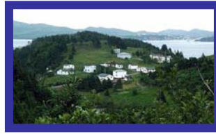
Mooring Cove – Greater Lamaline Area Development Association