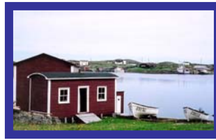
Change Islands – Lynn Pardy