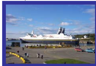
Port aux Basques – Zone 10 Regional Economic Development Board