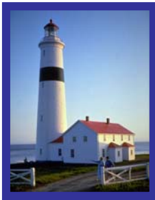
Lighthouse - Point Amour – Tourism, Culture & Recreation