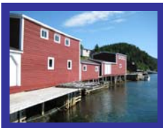
Croque Waterfront – Natasha Way