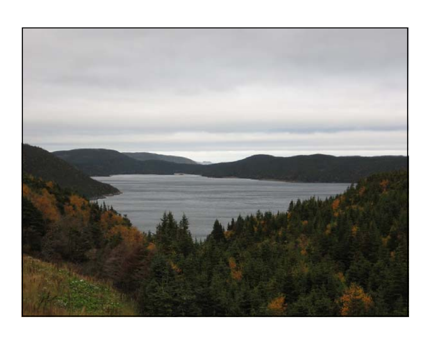
St. Anthony - Port au Choix Regional Council Activity Plan 2011-14