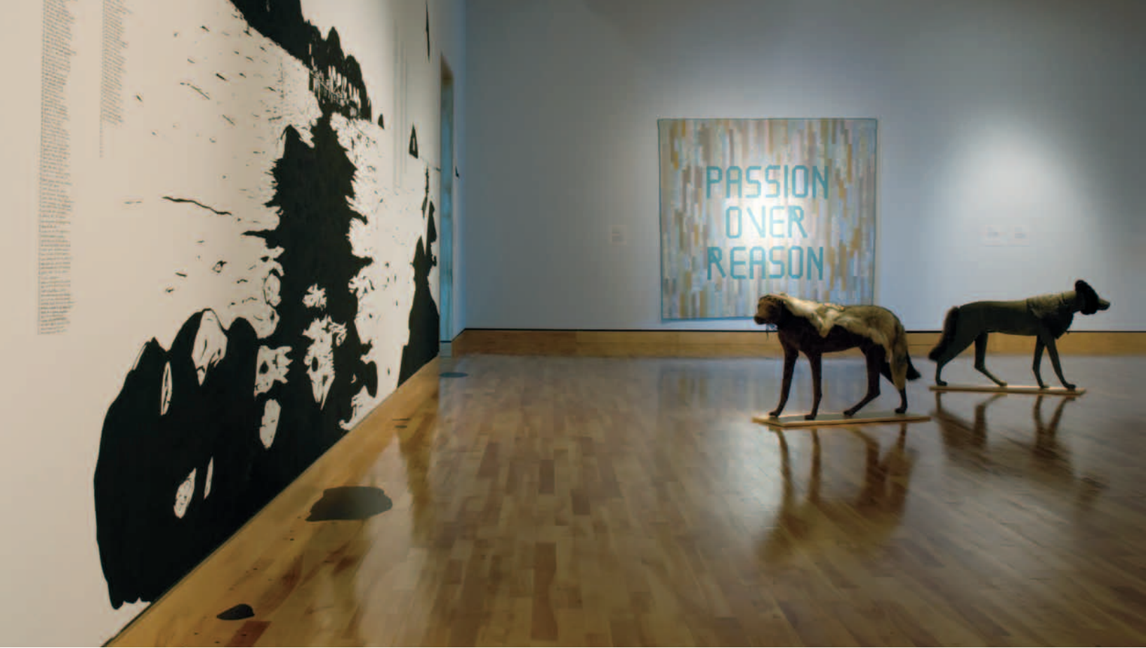
Folklore and Other Panics, Exhibition overview, January 17 – April 26, 2015. Photo by Ned Pratt